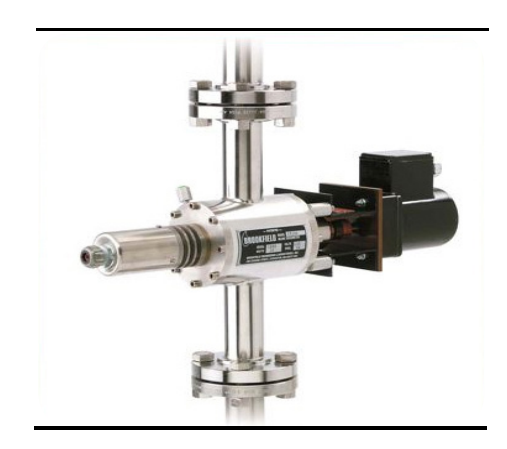
Figure 3: Typical Location for a Process Sampling Point

Figure 2: Brookfield TT-100 In-Line Process Viscometer