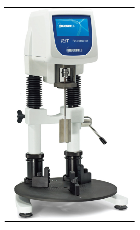
Figure 1: AMETEK Broofield RST Soft Solids Tester for Viscosity Measurement

Further improvement with even quicker turnaround time for viscosity testing can be achieved with an In-Line Process Viscometer. Variations are viscosity